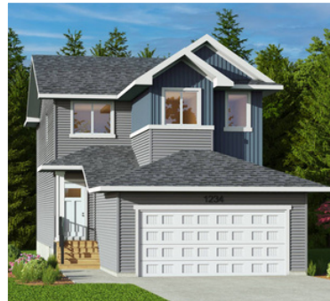
Elevation F1 - Concept Only