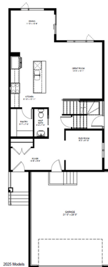
Main Floor Plan 888 SQ.FT.