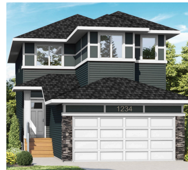
Elevation P1 - Concept Only