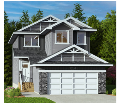
Elevation C1 - Concept Only