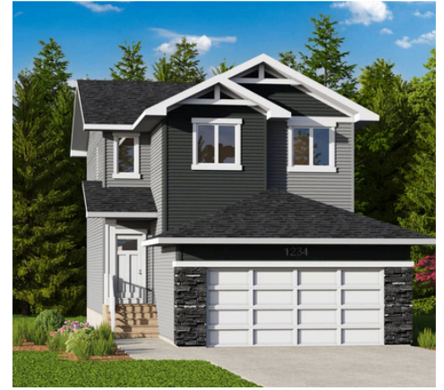
Elevation C1 - Concept Only