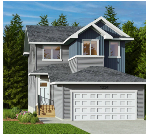
Elevation P1 - Concept Only