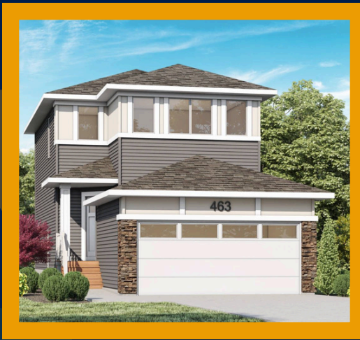
Elevation P1 - Concept Only