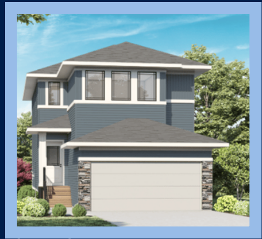
Elevation C2 - Concept Only