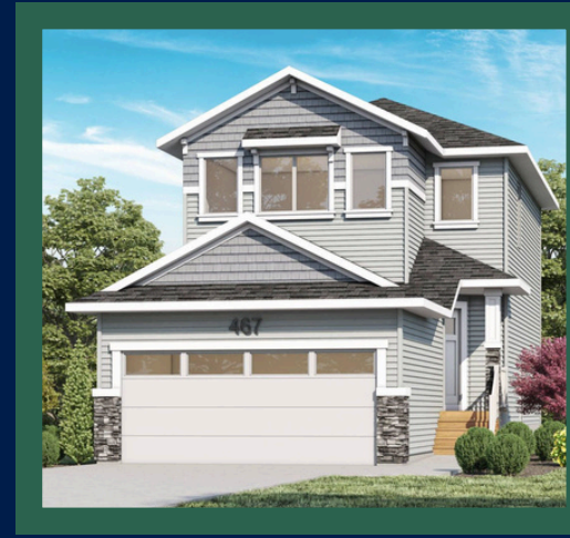
Elevation C1 - Concept Only