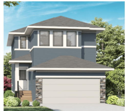
Elevation C2 - Concept Only