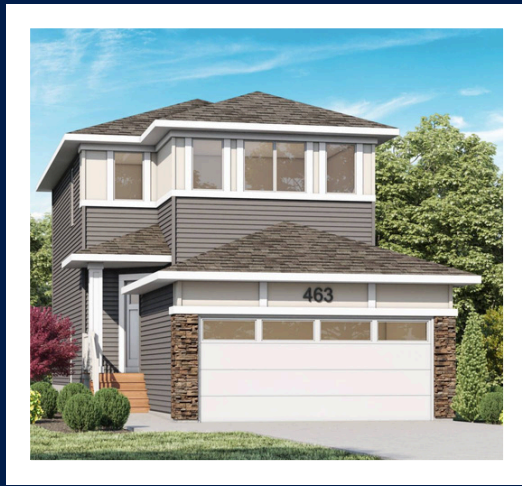
Elevation P1 - Concept Only