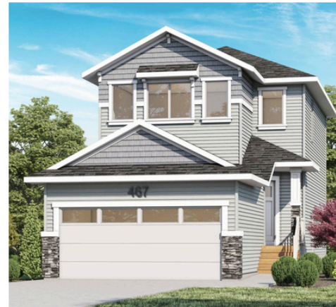
Elevation C1 - Concept Only